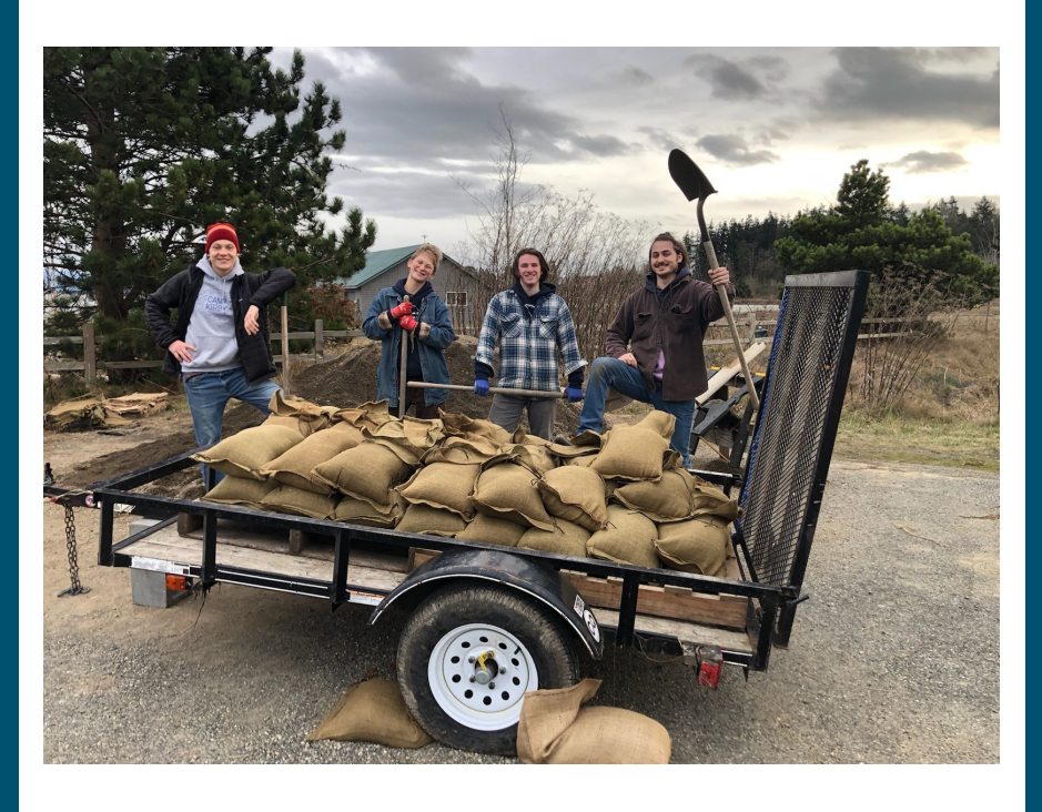
Thank you to the camp staff who helped ensure Camp was safe from January's King Tide!